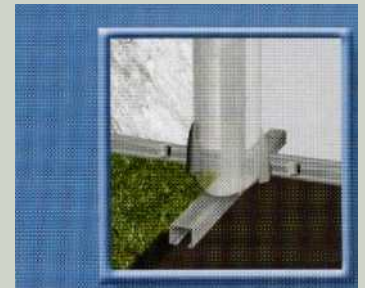
YARD EXTENDER SYSTEM ( Y.E.S )

Precise modular assembly Integrated seat cap Curved internal rib adjustable to all types of liner