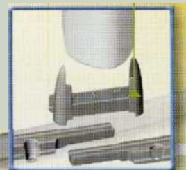
Sierra wall 1.32m (52")

Larger for greater stability Elevated rear track to keep the wall in place