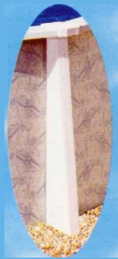
ComPacII Oval Support System

Galvanizing and numerous protective coatings for protection and corrosion resistance.