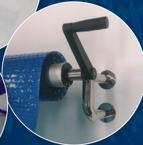
Eco - Fixed-wall