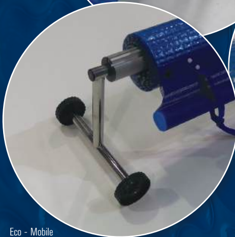
Eco - Mobile