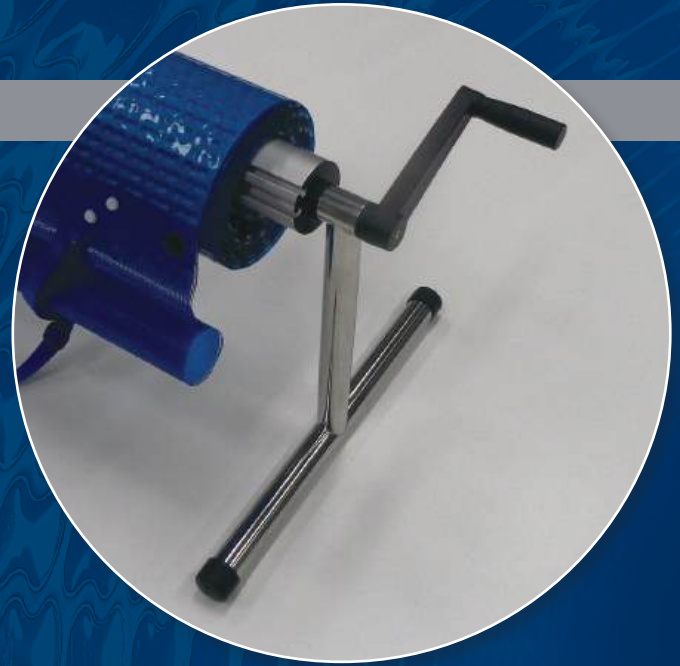
Eco - Fixed-floor

The Eco-Reel is available in three styles - mobile, fixed-floor and fixed-wall - each offering three size ranges for pools from 2.6m to 5.7m wide and is suitable for bubble covers up to 12m in length. However, the optimum operational capacity of the reel system is surpassed when a cover exceeds 50m 2 . Each system includes a crank handle, a slide-lock anti-unwind system and fully adjustable cover-to-roller strap kit as standard.